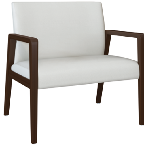
Model: VLDFIXB34G 34W 27D 35H 30SW 19SD 19SH 26AH

Kwalu's Valdina Bariatric chair redefines comfort and style for every lounge, lobby or waiting room guest. Built for maximum stability and strength, utilizing our steel reinforced joint system, this thoughtfully designed chair accommodates generous proportions and is available in two back heights. The chair back extends to the seat rail and the cleanout is incorporated behind the seat cushion providing a clean, functional look.