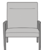
VLDFIXB34P 34W 27D 43H 26AH