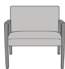
VLDFIXB34G 34W 27D 35H 26AH