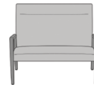
VLDFIXB46P 46W 27.5D 43H 26AH